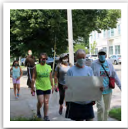
▲ Teams, family groups and individuals walked last year socially distanced or with their "bubble" group.